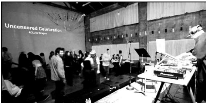
Photo of 2009 Uncensored Celebration

Make sure you check out this one-of-a-kind event. Celebrate yourself and celebrate free expression with the ACLU of Oregon. Tickets are $5 in advance and $7 at the door. Buy your tickets today at www.aclu-or.org/uncensoredcelebration .