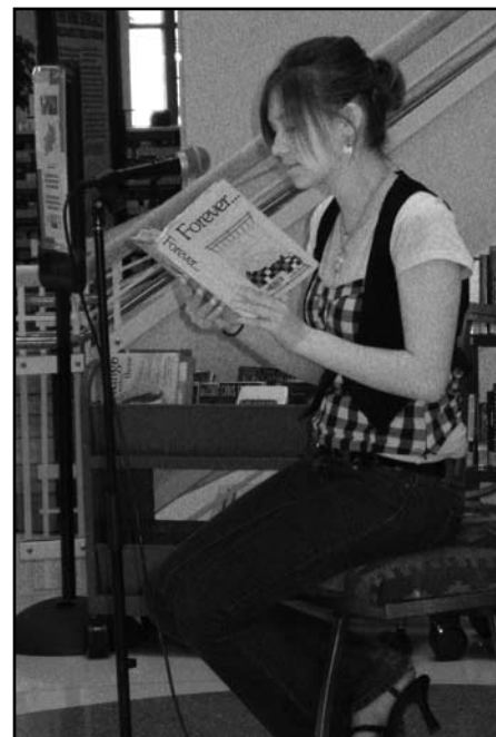
Judy Blume’s Forever was one of the many banned and challenged books featured at the 2009 Banned Books Read-Out at the Eugene Public Library.

Student Free Speech Forum: Working with the South Eugene High School ACLU Club, the chapter is planning a “Student’s Rights and Responsibilities” forum for November. A panel of students from local high schools will engage in a