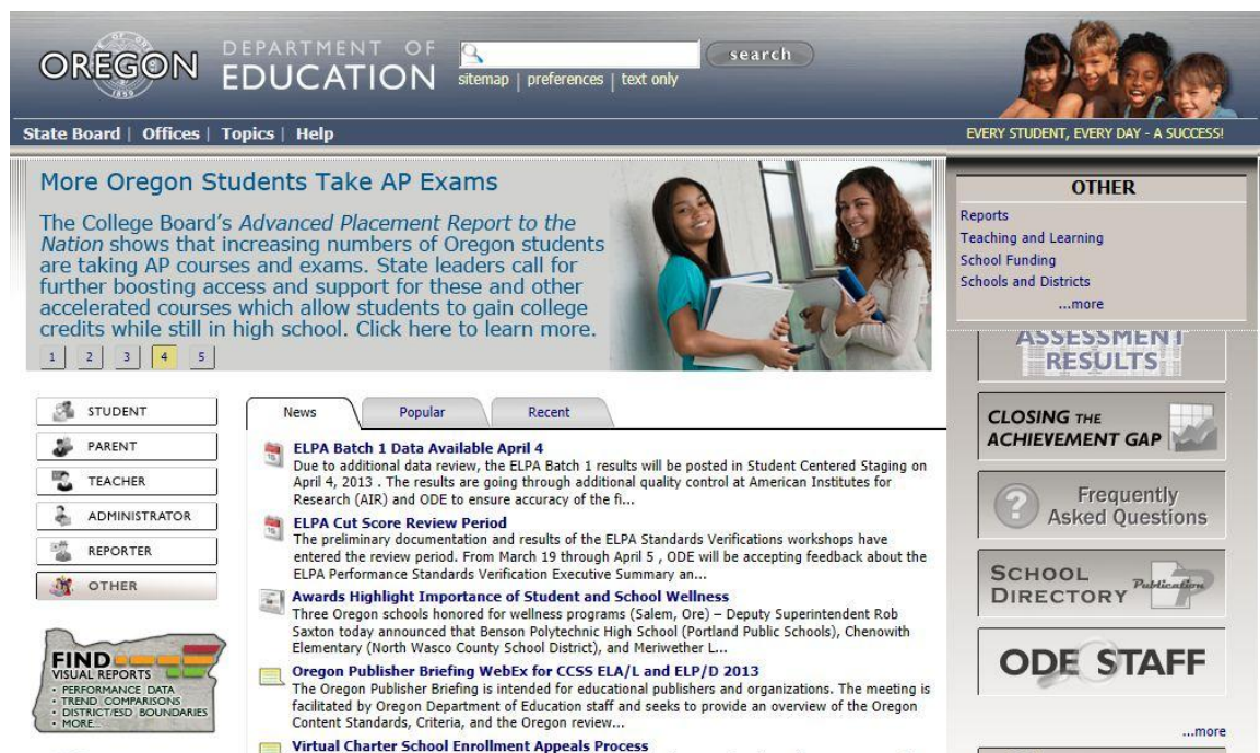
Screen shot of Oregon Department of Education home page

Note the button on the lower left that is a link to the Education Data Explorer page