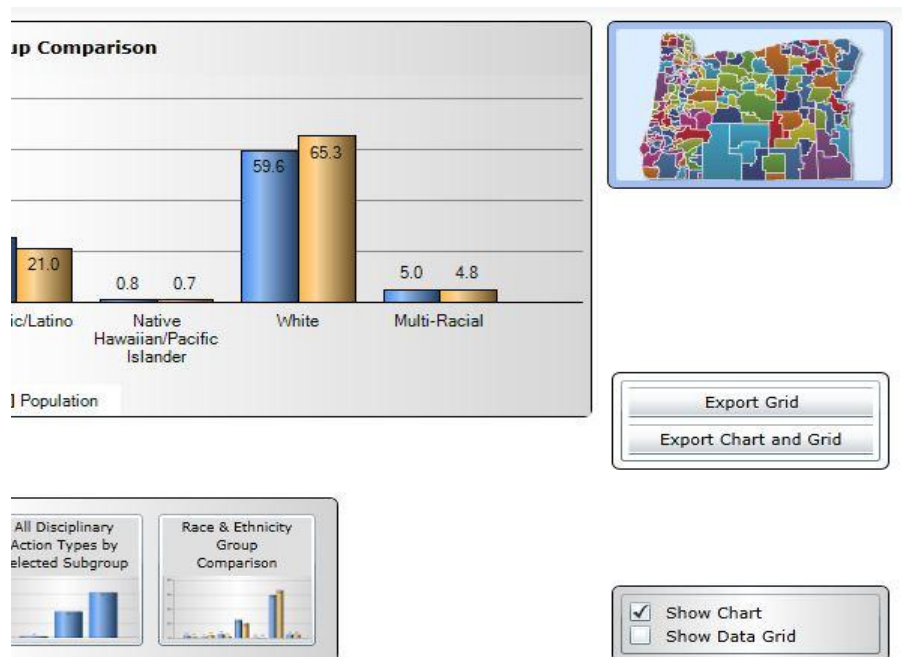
Right side of screen shot